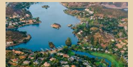
hillside trail systems