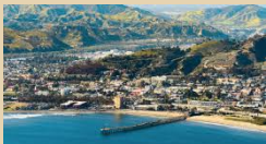
Ventura offers beaches