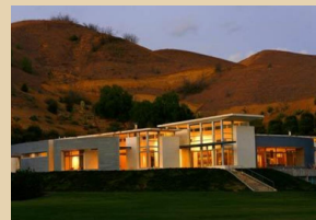
Hillside ranch estates

Properties are typically larger parcels offering privacy, agricultural potential, and long-term ownership patterns.