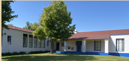
Somis Elementary School (K–8)