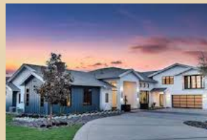
Custom-built acreage homes