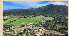
surrounding agricultural valleys.