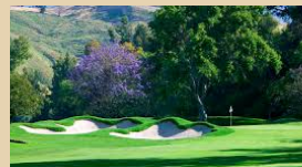
proximity to Saticoy Club