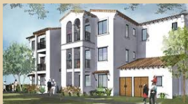
rural open space