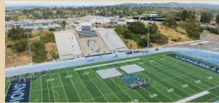
Adolfo Camarillo High School

School performance data available at: Niche Rankings , GreatSchools , California School Dashboard