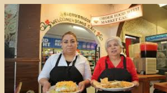
regional dining options