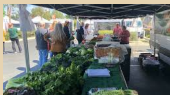
Local farm markets