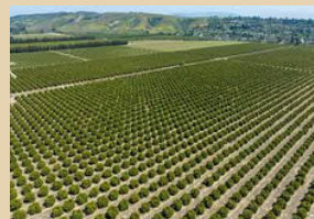
Citrus and avocado groves